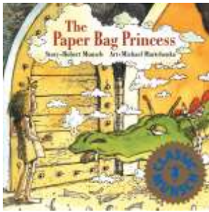
The Paper Bag Princess by Robert Munsch

Next week is National Women's Day. We have put together a few books from a suggested list run by PuffinSchools to celebrate this year's theme #EmbraceEquity