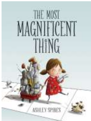
The Most Magnificent Thing by Ashley Spires